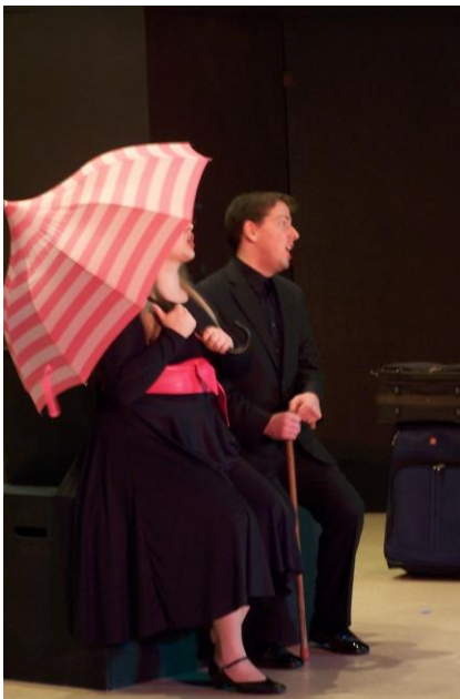
It was raining in the room.