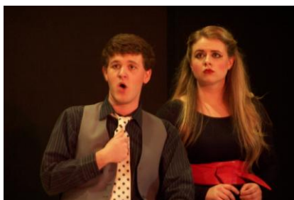
Scene from The Mikado , 2010 Druid City Opera Workshop