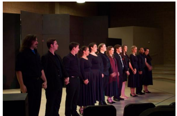
Final bow, May 22, 2010

Scenes from the 2010 Druid City Opera Workshop.